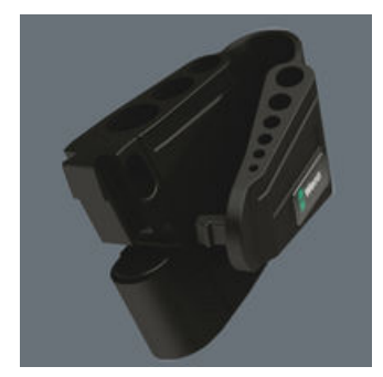
The wear-resistant clip material ensures that the L-keys are securely held yet are easy to remove.